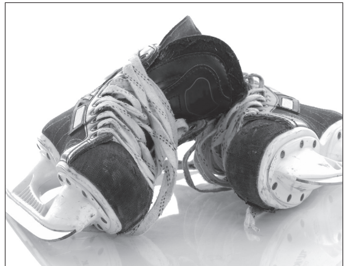
The scholarship winners of today may become the Platinum Jets’ donors and members tomorrow.

The Platinum Jets have funded scholarships for more than a decade now, and have even gone so far as to establish a perpetual fund with the Winnipeg Foundation to help ensure the scholarships continue to be available to North End students in the decades to come. Of course, this